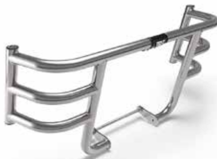
SILVER AIRFLY ENGINE GUARD