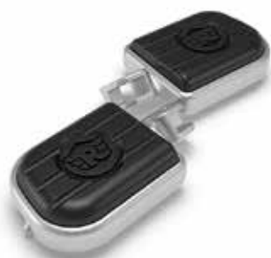
SILVER DELUXE FOOTPEGS