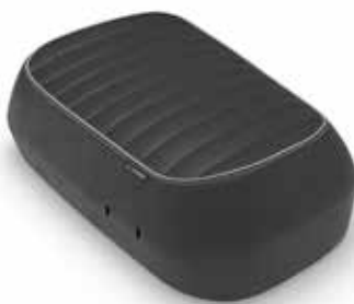
BLACK TOURING PASSENGER SEAT