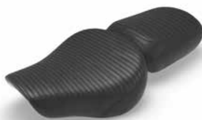
BLACK PLEATED SEAT COVERS