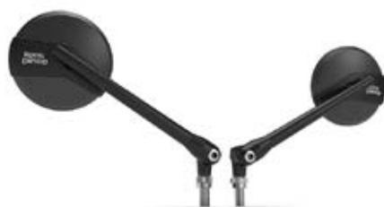
BLACK TOURING MIRRORS