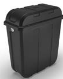
BLACK COMMUTER PANNIER