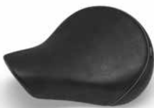
BLACK LOW RIDE RIDER SEAT